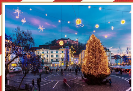
Ljubljana city centre and Fairy city in Maribor