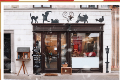
Shop windows of imagination in Škofja Loka